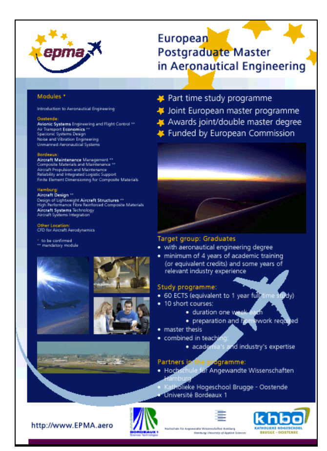
FIG. 3 EPMA poster