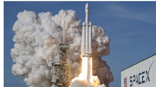
Falcon Heavy, SpaceX

This talk will chronicle the evolution of the disruptive commercial industry. Whether it is the billionaires, Bezos and Musk, or small bootstrap providers like Rocket Lab , Sierra Nevada , or Vector Space , these disruptors are rapidly reducing the cost of delivering satellites to orbit. How did we get here and where are we going are just two of the questions that will be examined by this lecture?